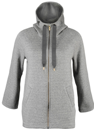
HEATHERED CORE MEDIUM GREY