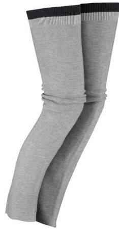
HEATHERED CORE MEDIUM GREY